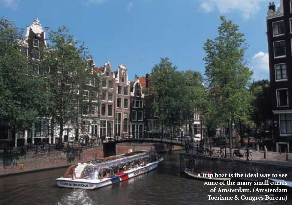
A trip boat is the ideal way to see some of the many small canals of Amsterdam.