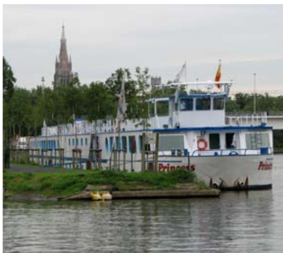
ABOVE: The delightful market place and belfry in Bruges. LEFT: Princess's pleasant mooring at Bruges is just a short walk from the city centre.

waterways but, strangely, no river cruisers of the size of Princess come this way. Yet another 'first' for Waterways World ? Well, research suggests that a Swiss cruise vessel has successfully covered much of our route but we think it will be the first voyage for English-speaking passengers on a hotel ship of around 80 metres. WW's Consultant Editor Hugh Potter and a representative of Kingdom Tours will accompany the cruise.