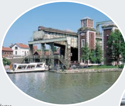
Les Fontinettes boat lift.

Opened in 1888 to replace a bottleneck staircase of five locks, this vertical hydraulic boat lift was designed by Edwin Clark who planned the first such lift at Anderton. It was larger than Anderton, taking 38m by 5m barges, and although based on the same principle it differed in its construction in several ways. It was replaced by a modern deep lock with 13m drop in 1967, but remains as a static monument which we will be able to visit and discover the differences between it and our own Anderton lift. There is also a historic film of it in operation.