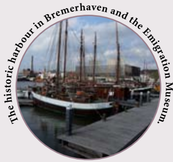
The historic harbour in Bremerhaven and the Emigration Museum.

Our cruise will be the first visit of a river cruiser to the seaport of Bremerhaven at the mouth of the River Weser. Almost totally destroyed in WWII, Bremerhaven has met the challenges of a modern port and developed into a vibrant city attracting tourism (particularly sea cruises) with its excellent museums, visitor experiences and special events reflecting its maritime heritage. We particularly recommend the German National Maritime Museum, the Climate House (an educational look at climate change opening in March 2009), the Zoo at the Sea, the German Emigration Centre, the Historical Museum and the harbour bus tour. There is yet more to be seen – our day in Bremerhaven will whet the appetite for a second visit! www.bremerhaven-tourism.de