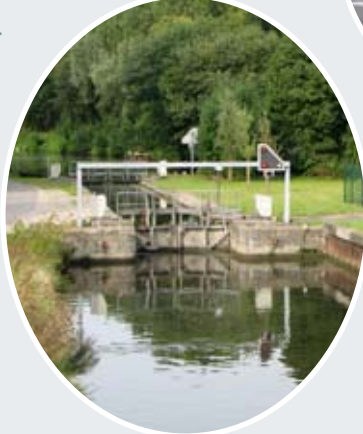
The entrance lock to the Roubaix Canal from the Escaut in Lille.

Completed in 1893 and closed in 1985, the Roubaix Canal is part of the Deûle-Escaut link connecting Belgium with France. Restoration for pleasure craft is now almost complete in a 4-year €37m cross-European project. Like many schemes in the UK, this will bring substantial regeneration benefits to the towns and villages on its 28km 15-lock route. Just as we go to press, it has been announced that funding has been secured to complete the works in 2009 with an opening ceremony planned for Saturday 19th September during our visit to nearby Lille. We are hoping to be able to offer passengers the opportunity to attend the ceremonies and/or inspect the restored waterway by means of an optional excursion. This promises to be the European canal opening of the decade!