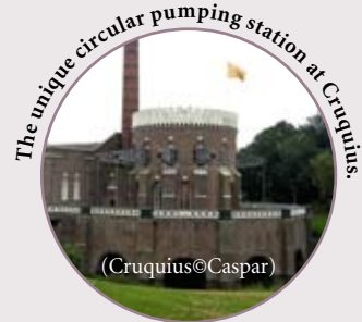
The unique circular pumping station at Cruquius.

The large unique circular Cruquius engine has been under restoration by volunteers since 1982. Using steam to drive the engine was out of the question so various forms of power were reviewed and modern hydraulic techniques were chosen. The engine was officially operated for the first time in 2002 by HRH Prince Willem Alexander of The Netherlands. www.cruquiusmuseum.nl/framesenglish.htm