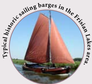
Typical historic sailing barges in the Frisian Lakes area.

A major scheme embracing some 300 separate projects has been underway since 2001 and is proving a major benefit to the important boating industry as well as the road and rail infrastructure within the Dutch Province of Friesland. Five new aqueducts have already replaced traditional lift bridges (we will cross two) and a further five have recently been included in Phase 2 of this €495m scheme. We have invited Jaap Goos, the Project Leader, to give a short talk during our cruise www.friesemeren.nl