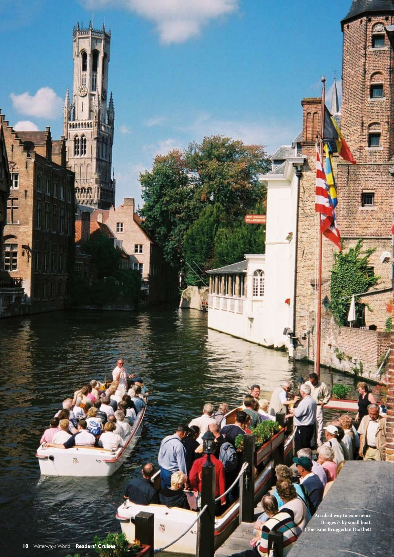
An ideal way to experience Bruges is by small boat.