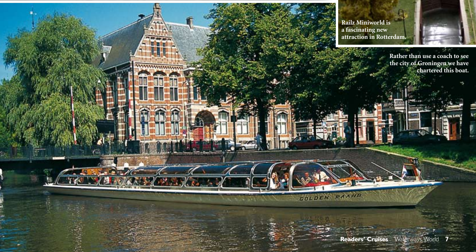
Rather than use a coach to see the city of Groningen we have chartered this boat.