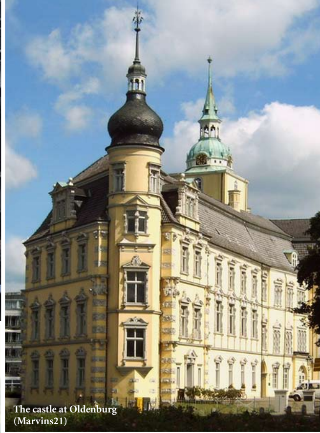
The castle at Oldenburg (Marvins21)