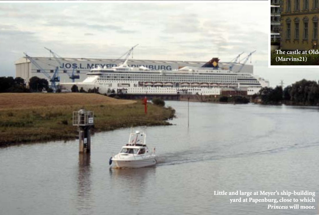
Little and large at Meyer's ship-building yard at Papenburg, close to which Princess will moor.