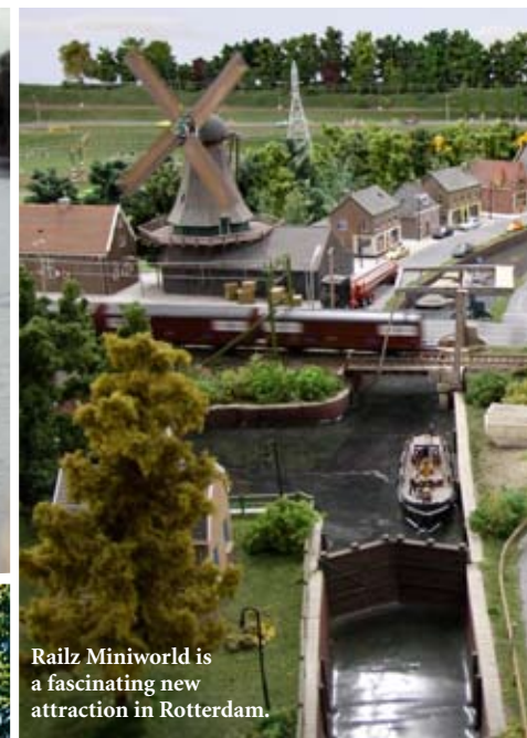
Railz Miniworld is a fascinating new attraction in Rotterdam.