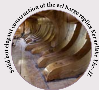
So plain but elegant construction of the eel barge replica Korneliske Ykes II.

There are three projects in Friesland to build replica vessels of wood in the traditional style. We will visit two of these schemes whose benefits are: training young people in traditional skills; preserving a culture; and attracting tourism. The eel barge under construction at Heeg is due for completion shortly before our arrival! It is particularly significant to us because the former long running trade carried out by these barges was with London where they were unloaded at the Dutch mooring above Tower Bridge for Billingsgate Fish Market. www.dehelling.info