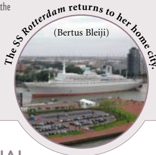
The SS Rotterdam returns to her home city.

This former ocean-going cruise ship is as important to the Dutch as some of the great names in British maritime history are to us. The SS Rotterdam sailed the world from 1959 to 2000 and was the largest passenger ship ever built in The Netherlands. On 4th August 2008, she returned to Rotterdam following a refit in Willemshaven, Germany, to act as a static hotel in the heart of the city. We are offering an optional extension to our cruise to spend two nights on board with time to visit the many attractions of the Rotterdam area. For more information on the history of this vessel refer to www.sshotterdam.net For Rotterdam attractions, visit www.rotterdam.info/uk .