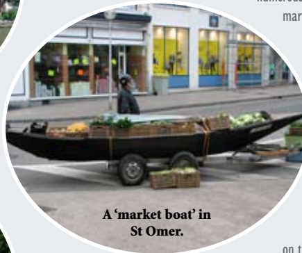
A 'market boat' in St Omer.

market gardeners grow vegetables on the extremely fertile marshland soil. Traditionally they crop their famous cauliflowers in summer and endive in winter. They still transport their produce by boat and sell them on the local markets. A boat trip is the only way to see this fascinating area, and an optional excursion will be offered on this cruise